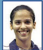
Saina Nehwal - Bronze