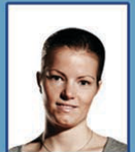
J Fischer & C Pedersen - Bronze

J Fischer & C Pedersen (DEN) Beat T Ahmad & N Iliyana (IDN)